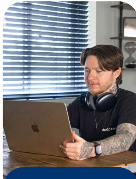
Web Design & Hosting