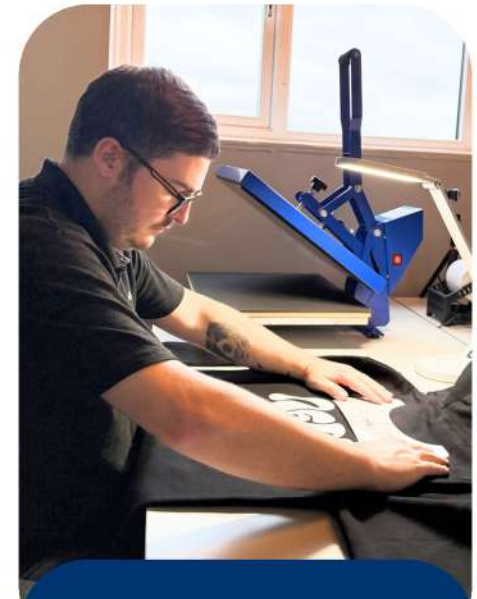
Print & Branded Materials