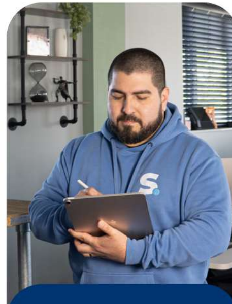
Branding & Graphic Design